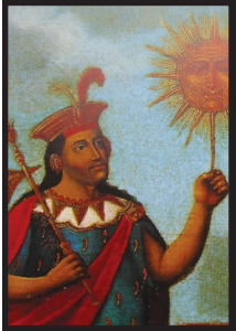
MANCO CAPAC