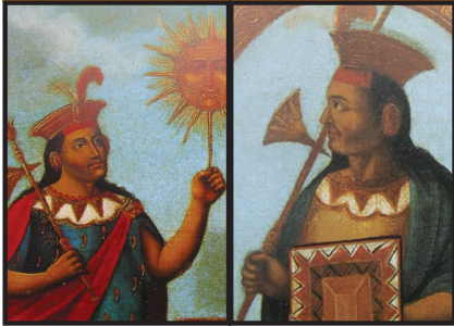
MANCO CAPAC I. VAUTIER