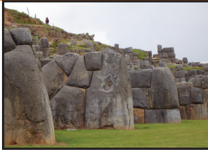
SACSAHUAMAN.