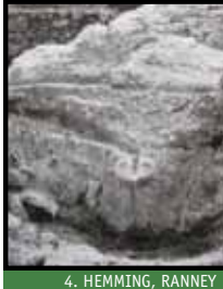
4. HEMMING, RANNEY

6. CHINCHERO. "Town of the Rainbow" Also