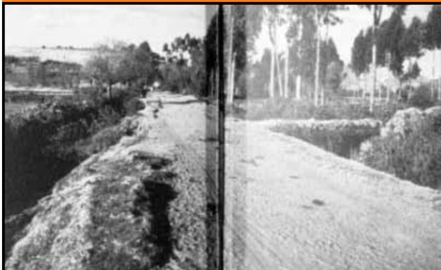
25. CAUSEWAY. BINGHAM

captured general to trial. He was blamed for the insurgency, burned alive.