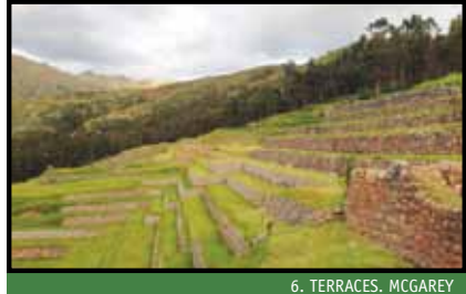
6. TERRACES. MCGAREY

called Clinta and Calispuquio. On the road from Cuzco to Sacred Valley and past the lakes of Huaypo and Piuray . 14 Beyond Sacsahuaman, 9mi from Cuzco. 5