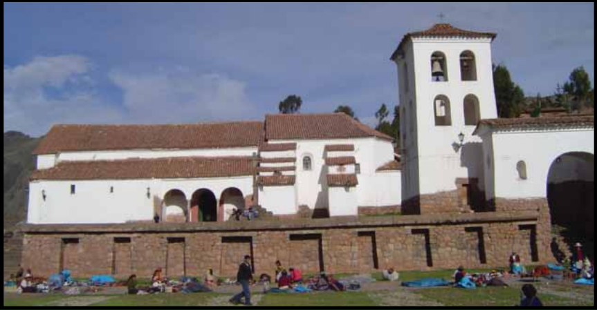
6. NICHES AND CHURCH. D ROSCOE