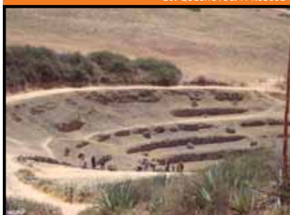
20. M ROSCOE

John Earls, 4 Special high altitude strains of crops were developed. If corn had not been developed at a site like this then high population Andean cultures would not have been possible.