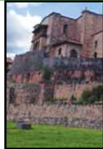
14. T ROSCOE