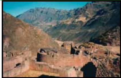
1. A ROSCOE

Main town in Sacred Valley. Has an incan square and a spanish square. Has nice orchards and gardens. Manco Capac II had his headquarters here during the 1536 Rebellion. The spanish charged the town and forced out the incas early in the rebellion, but left soon with Cusco under attack. Almagro re-captured