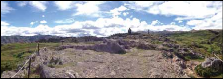
15. TOP. T ROSCOE