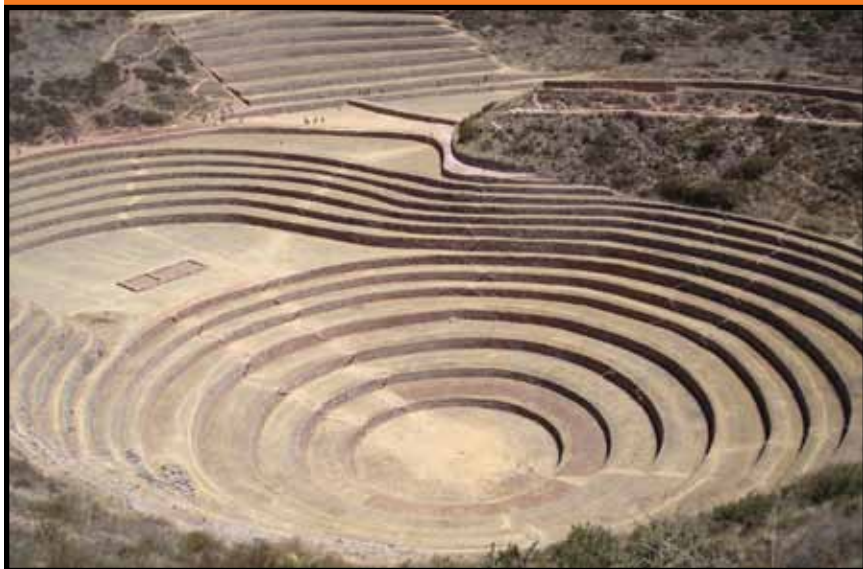
20. QUECHUYOC. M ROSCOE