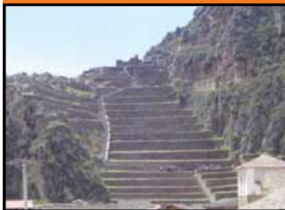
18. D ROSCOE

Temperature was originally measurable by having cups of water freeze over night, then checking the rate of thaw in the morning. Area farming is still a complicated crop rotation and plantings. 4