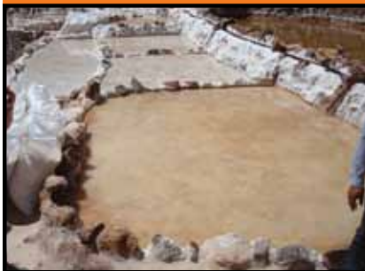
21. UP CLOSE. M. ROSCOE

2mi from Yucay at the intersection of the the Cusco-Chinchoero road and Urubamba R. 4 A great center base for exploring the valley. Lovely village, there’s an avenue along the west side