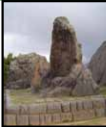
12. A ROSCOE

Two caves are on S side. A large crack runs the width of the rock, wide enough to walk through. Cave on SE side is highly carved of pumas and snakes. Inside are niches for holding mummies and an altar. On full moon before winter solstice, moonlight shines upon the altar . 4