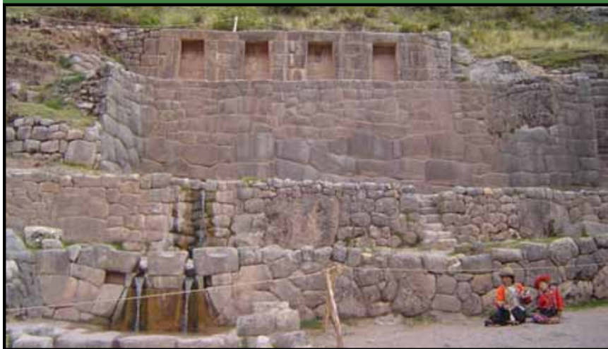
10. A ROSCOE