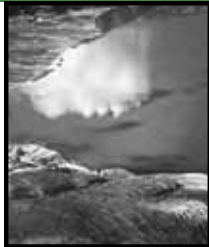
7. HYSLOP, BRIDGES

Above are stairways, seats, and water channels. There's also a carved drainpipe cut vertically into the rock. Be careful there's a 30m drop to a grotto under the outcrop. 4