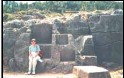
2. A ROSCOE

5. SUCHUNA DETAILS. Includes inverted stairs,