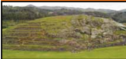
16. D ROSCOE