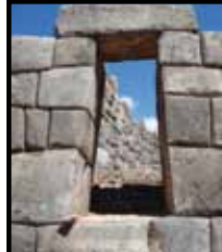
7. M ROSCOE