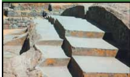
14. A ROSCOE