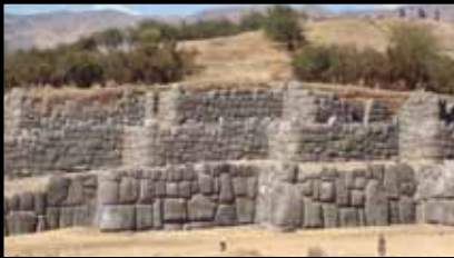
6. M ROSCOE