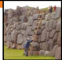
22. D ROSCOE

of amphitheater and Roderado Hill . Looks like it didn't make it to its destination. Cieza, 3, 4 But it's a natural outcrop, carved and embellished. 4