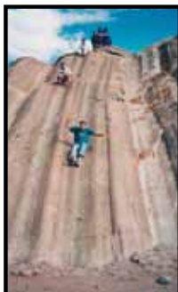
17. A ROSCOE