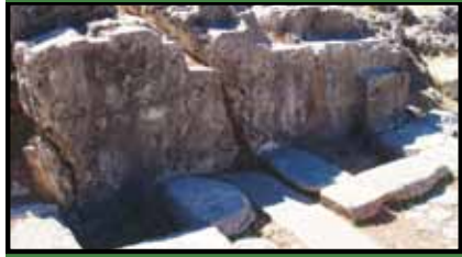
5. DRINKING FOUNTAIN. M ROSCOE