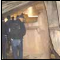
1. D ROSCOE

Warmi Kajchana, where a woman is raped. Excavated in 1934. Evidence of a phallic cult found. N of throne , full of passages, stairways, niches, and Tiahuanacan step motif . Features a throne and labyrinth. There are 2 tunnels formed naturally by erosion in limestone. 4