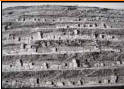
15. HEMMING, RANNEY

20. TEETH. The base of the terraces form the teeth of the puma and excellent for defending.