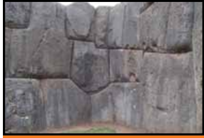
20. D ROSCOE

Attackers are forced to expose their backs when assailing the walls. Some stones weigh up to 150 tons. The wall is 1200ft long. 6