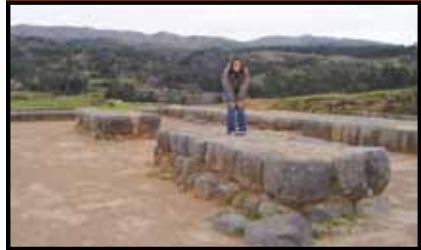
24. D ROSCOE