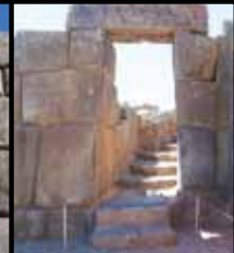
9. M ROSCOE