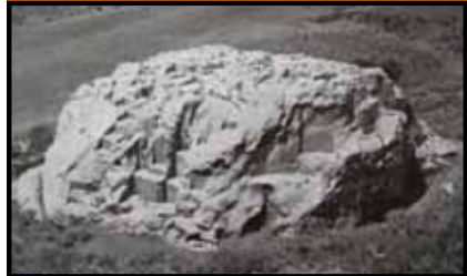
25. HYSOP, BRIDGES

of amphitheater and Roderado Hill . Looks like it didn't make it to its destination. Cieza, 3, 4 But it's a natural outcrop, carved and embellished. 4