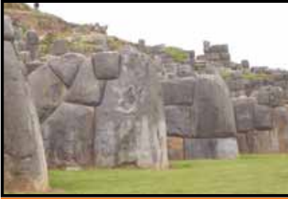
19. D ROSCOE