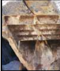
5. INVERTED. M ROSCOE

Most of the rocks are from Muina and Rumicolca , 12.5mi away. 3, 7