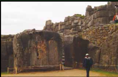
8. D ROSCOE