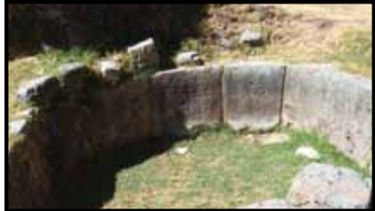
5. JACUZZI. M ROSCOE