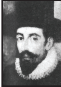
VICEROY TOLEDO. HEMMING